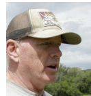
Bruce Hennessey Maple Wind Farm Vermont

This video was filmed on location in Vermont, Rhode Island, and Pennsylvania. The video also features interviews from real pastured poultry farmers from across the country.